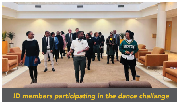
ID members participating in the dance challenge

ID MEMBERS PARTICIPATE IN "FREEDOM IS COMING TOMORROW" DANCE CHALLENGE