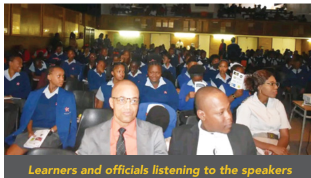
Learners and officials listening to the speakers

On 25 April 2023, the NPA in Mpumalanga hosted school outreach awareness programme at Lowveld High School and St. Mark International School in Nelspruit. The campaigns were hosted in partnership with the Department of Education, the Department of Correctional Services, the SAPS, and SANCA. Learners were empowered with information pertaining to the role of the NPA within the JCPS cluster, drug and substance abuse, case reporting, and bullying.