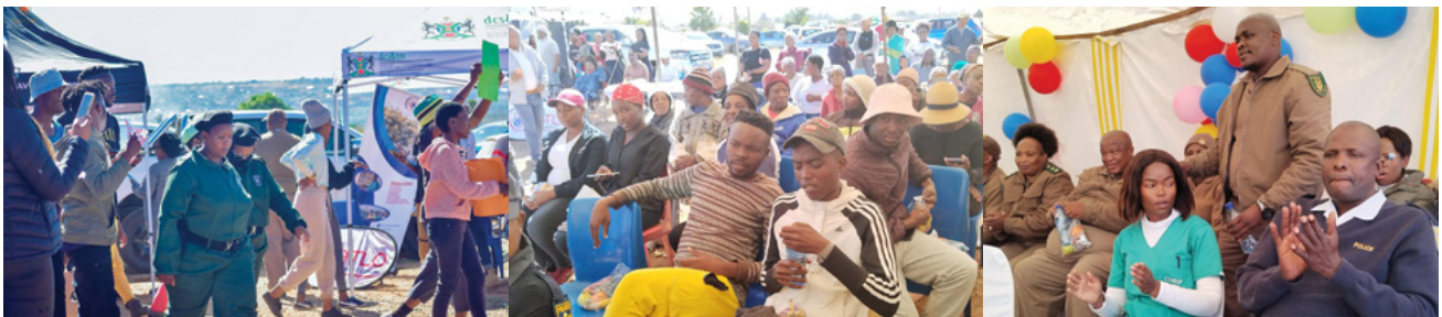
NPA staff members with Klipgat community members

In June, one such dialogue was to the Bheki Section of Klipgat, where NPA staff members and Thuthuzela Care Centre (TCC) staff talked about the TCC, sexual offences, rape, bail applications, protection orders, bullying and maintenance. Departments and NGOs that took part included the Departments of Correctional Services and Health, the SAPS, the Katlo Development Center (NGO), the Lesedi Youth Care Center (NGO) and Together Mzansi (McDonald's initiative promoting cleanliness).