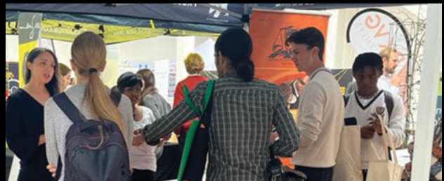
NPA officials from the Western Cape speaking to University of Stellenbosch students

The NPA in the Western Cape hosted an open day at Stellenbosch University to create awareness around the organisation's training programme for law graduates. The Aspirant Prosecutor Programme is an internship programme within the NPA that entails in-service training, which assists law graduates in gaining practical prosecutorial experience. The programme runs for twelve months, after which the completion thereof enables competent candidates to be appointed at entry-level prosecutorial positions in the NPA.