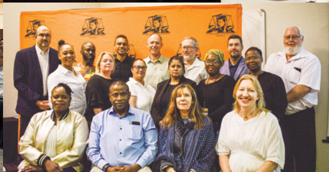
Specialised Tax Unit prosecutors attending the training