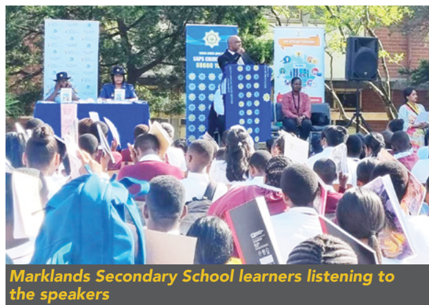
Marklands Secondary School learners listening to the speakers

On 23 March 2023, to commemorate Human Rights Day, the NPA in KwaZulu-Natal in conjunction with the GCIS, SAPS, Dept of Social Development and Lifeline, hosted an awareness programme at Marklands Secondary School in Chatsworth. Topics discussed were human rights and responsibilities in relation to school violence and bullying. Each department also told the learners about their mandate. The NPA explained our role in the justice system and how we work together with the other stakeholders within the justice system. Members of the NPA from Sexual Offences and Community Affairs (SOCA) Unit represented the organisation.