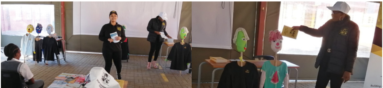
Obed More Special School learners listening to the speakers

On 30 May 2023, the NPA visited the Obed More Special School in Brits, to educate learners about their rights, court processes and court preparation services. The learners were also given information about services offered by SOCA, especially the TTCCs.