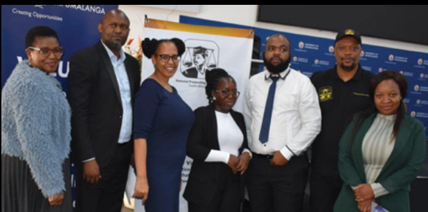
NPA Mpumalanga officials with officials from various organisations at the University of Mpumalanga

The NPA visited the University of Mpumalanga to educate students about gender-based violence and services offered by the NPA to support and empower victims when navigating the criminal justice system. The NPA in collaboration with various partners have set up one stop-facilities called Thuthuzela Care Centres, aimed at reducing secondary victimisation and building cases ready for successful prosecution. Sixty-two centres are currently offering a safe haven for victims of GBV and sexual assault in various hospitals across the country.