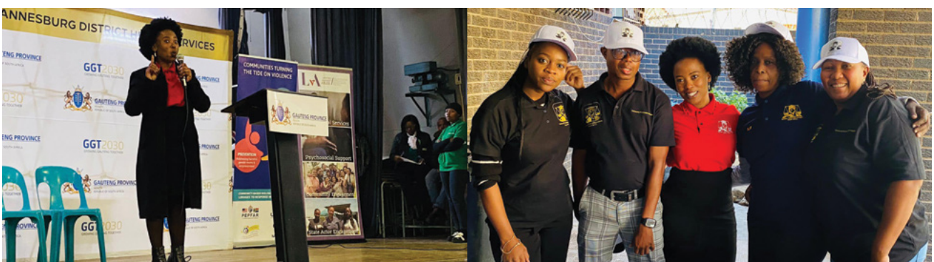
NPA staff members speaking and exhibiting at Endas Secondary School

In May 2023, as part of commemorating Child Protection Week, Court Preparations and Community Prosecutions visited St. Endas Secondary School to educate learners about sexual offences and where to get help. They were also educated about the dangers of committing offences at a young age and the consequences thereof/how it negatively impacts their future. The NPA disseminated information material to the learners.