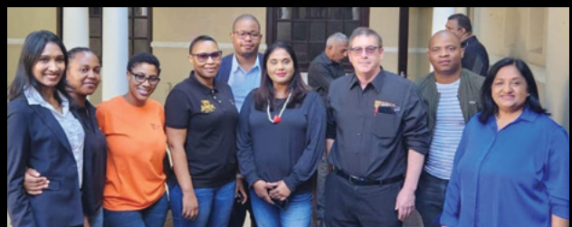
NPA KZN officials with the Deputy Minister of Justice, Mr John Jeffrey at the career expo

The NPA in KwaZulu Natal attended career expos hosted by Varsity College, UNISA and the University of KwaZulu Natal Student Chapter of the National Association of Democratic Lawyers (NADEL). The NADEL event was attended by the Deputy Minister of Justice, Mr John Jeffrey. Students were given information about career opportunities within the justice system and the Aspirant Prosecutor Programme, an internship programme within the NPA that entails in-service training, which assists law graduates in gaining practical prosecutorial experience.