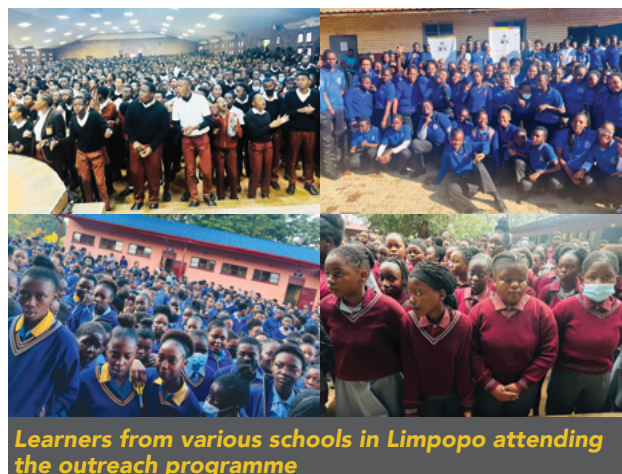
Learners from various schools in Limpopo attending the outreach programme

On 11 April 2023, the NPA in Limpopo conducted outreach programmes in schools around Thohoyandou. Learners from Mbilwi Secondary School and Mphaphuli High School were taught about bullying, harassment and services provided by the Tshilidzi Thuthuzela Care Centre for victims of sexual violence. Various other schools in Limpopo were also visited in May. This included the Thohoyandou Secondary School, the Khwevha Commercial School, the Nkowankowa Combined Meridian School, and the D.Z.J Mtebule Junior Secondary School.