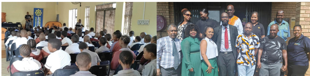
NPA staff members and learners of Ifafa Primary School at the Community Prosecution event in Umzinto

On 21 April, the NPA in KwaZulu-Natal hosted a Community Prosecution event in the Umzinto area. The event was aimed at educating learners from Ifafa Primary School and Bongumbhele Senior Primary School on bullying and child protection measures. The event was hosted in partnership with the Department of Community Safety and Liaison, the Department of Health, the SAPS, Lifeline, the Department of Correctional Services, and traditional leaders from the local communities.