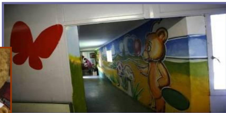
Baragwanath Thuthuzela Care Centre, child friendly environment