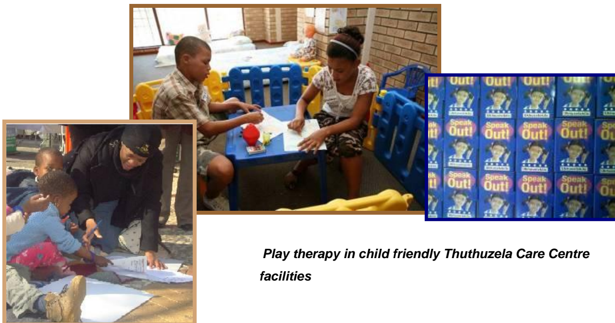
Play therapy in child friendly Thuthuzela Care Centre facilities

Various donors have also contributed to making the model child-friendly, through offering technical expertise for the installation and availability of special equipment and furniture. These include two way-mirrors, posters, CCTV, drawings, and anatomically correct dolls comprising five family members, to help prepare children to appear in court, should that become necessary.