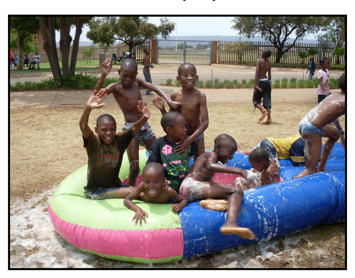
Children having fun in Mamelodi.

On 23 October 2010 the Mamelodi TCC, together with other stakeholders hosted a fun day for the communities of Mamelodi East at the Vista Campus Sports Grounds.