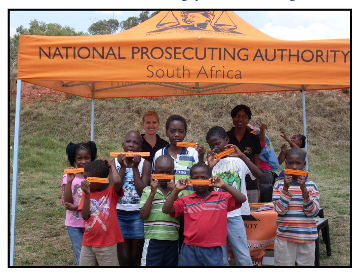
Children showing off some of the items given by the NPA.

Another fun day was held by the Pretoria Court Preparation Officers for the destitute children from various children's homes in Pretoria on 6 November 2010. The fun day, which was held at the Pretoria Rugby Club, was organised in