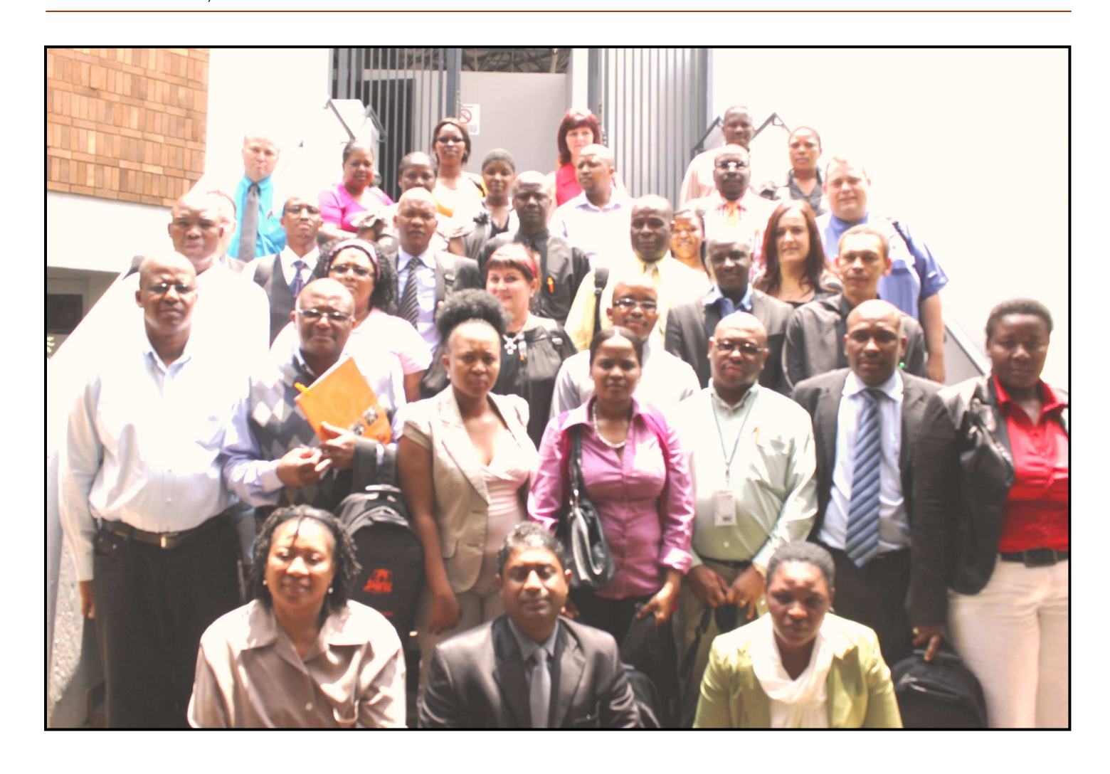
NPA Value Champions launched on 29 October 2010