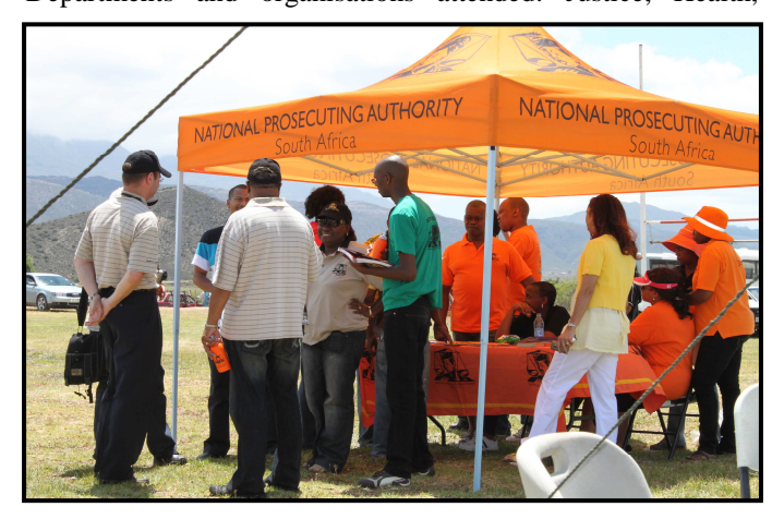
NPA members at the exhibition stand at Zoa, Western Cape

members of the poor Little Karoo Community. The following Departments and organisations attended: Justice, Health,