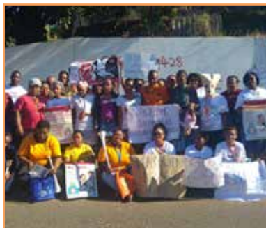
See page 6