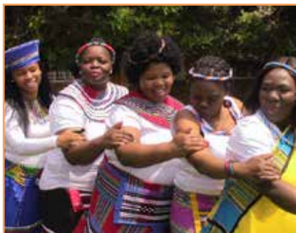
See page 12