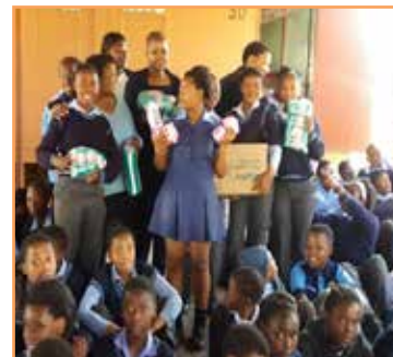
See page 19