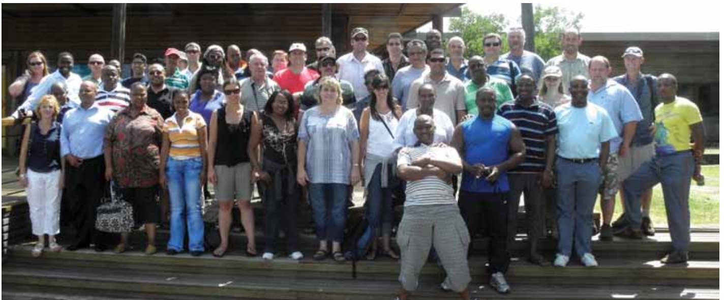
Some of the prosecutors who have already attended the advanced course in environmental crimes.

The St Lucia course followed on a similar pilot "advanced" course that took place in the Western Cape in February 2010. The programme for these advanced courses was adapted from the normal basic content to cater for the needs of prosecutors who deal with environmental cases on a regular basis. Through these interventions the Department seeks to build on the solid foundation that has been laid over the past five years by focusing on the skilling of prosecutors who regularly prosecute environmental crimes, while maintaining the broad-based awareness raising efforts through the Justice College partnership.