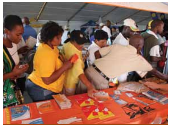
NPA exhibition stall - Human Rights Day 2011

In his key note address, President Jacob Zuma urged all people to celebrate South Africa's Constitution, and use it as an instrument of freedom, as a tool that enables us to enjoy the freedoms and human rights that so many heroes and heroines sacrificed for.