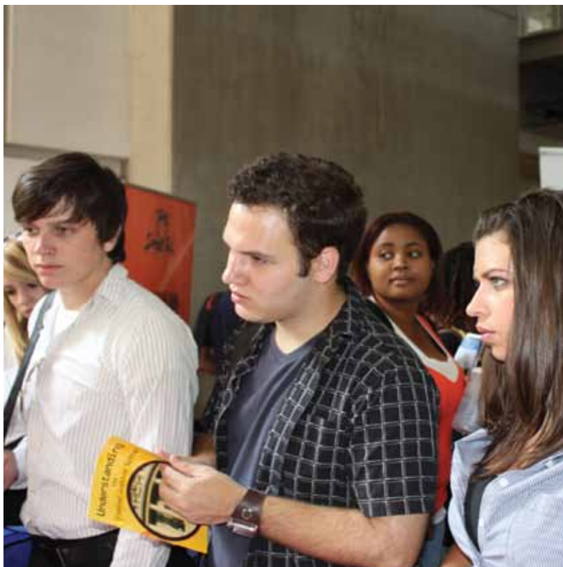
Enthusiastic students listening attentively to the NPA presentation